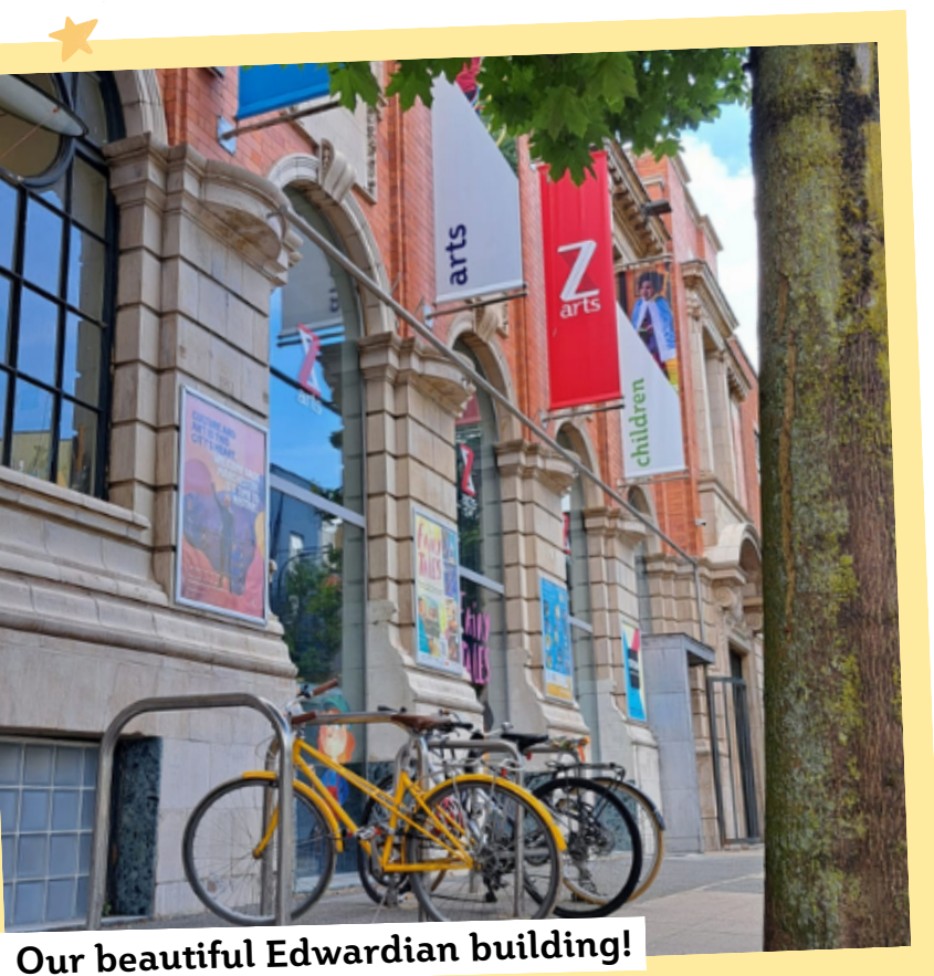
Our beautiful Edwardian building!

We look forward to hearing from you soon!